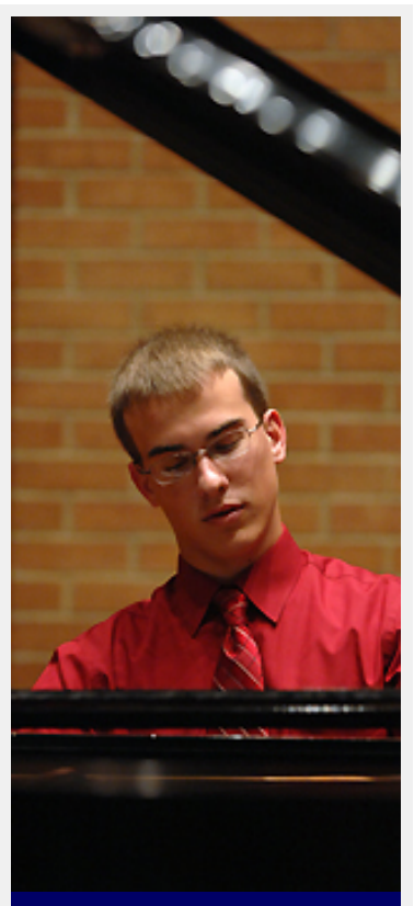
Kent State University's Hugh A. Glauser School of Music has embarked on two campaigns to become an All-Steinway School. The school still needs 21 more Steinway pianos before the school reaches its All-Steinway goal. <u>Read more</u>.